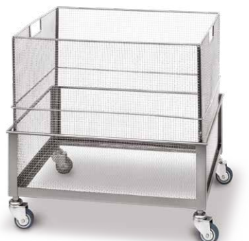
Vegetable collection trolley

Dimensions: 935 x 535 x 655 mm ( TILTING Atir I and TILTING Atir II ) or 610 x 510 x 590 mm ( Atir II – Atir III )