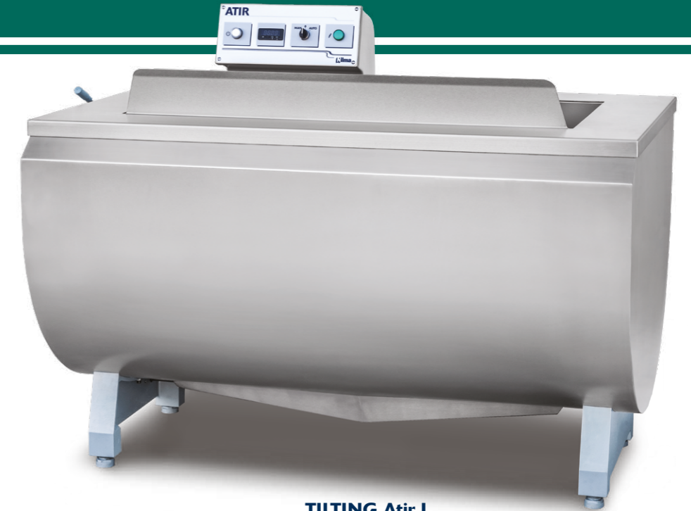
TILTING Atir I