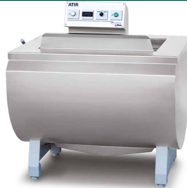
TILTING Atir II