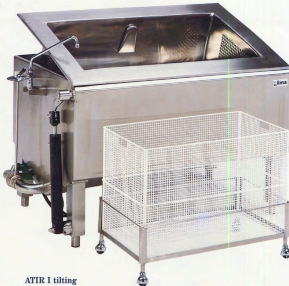
ATIR I tilting

the complete range of ATIR washers is NSF and UL listed